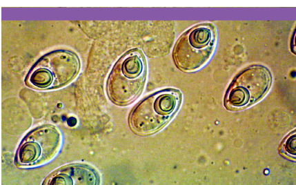
Myxozoan fish parasites

COMMUNICATION & PRESS: marieke@aquatt.ie