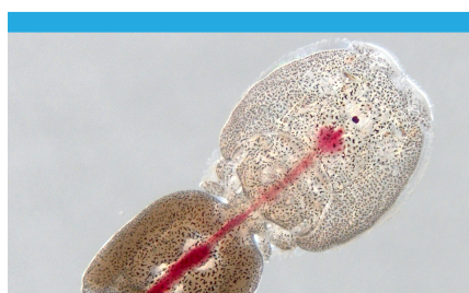
Adult female sea louse with salmon blood in gut